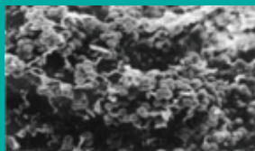
Figure 2: AMYCOT® digestion of Trichoderma Viride after 24 hours showing complete digestion of the fungal cell wall leading to the formation of inert protoplasts.