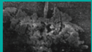
Figure 3: AMYCOT® digestion of Trichoderma Viride after 5 days showing that all that is left is a mass of dry cytoplasmic matter.